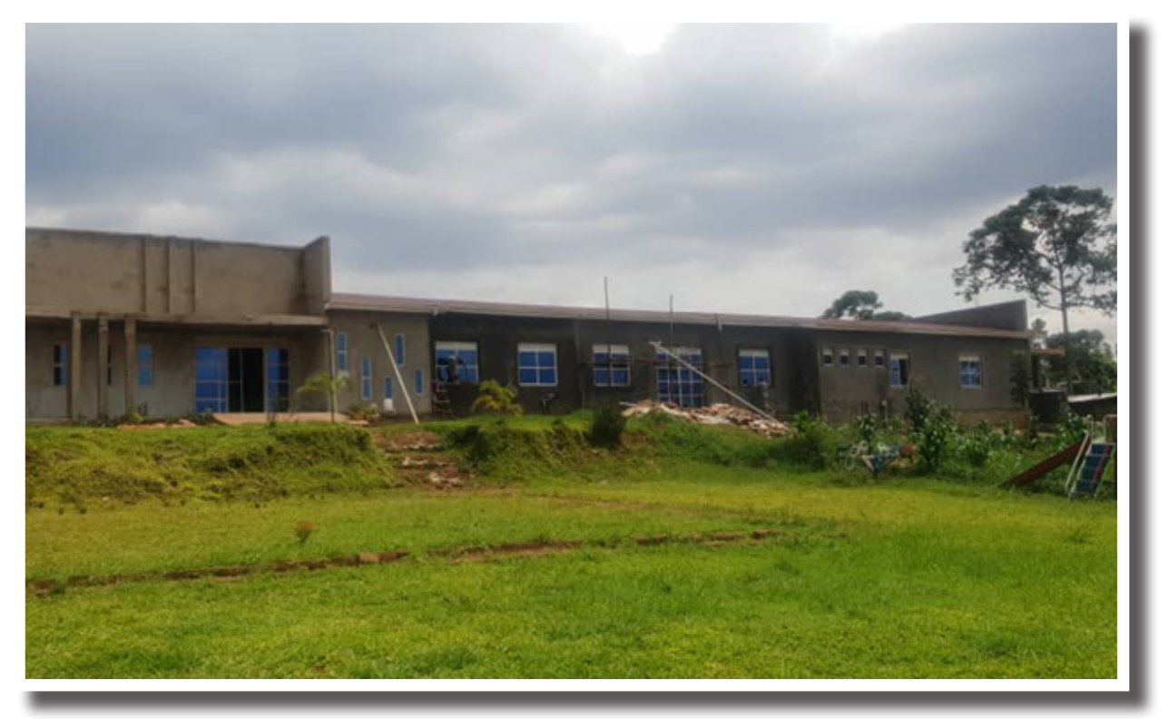
The outside view of the new Angel's center.