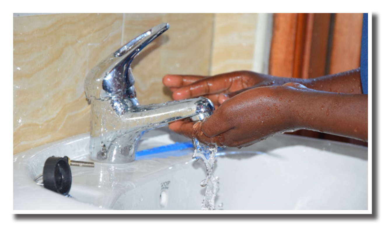
Tamale- beneficiary at ACCSN washing his hands at one of the sinks.

The routine learning sessions were however interrupted by COVID-19 restrictions and parents were not able to bring their children to the center for early learning and integrated therapy services for close to 4 months.