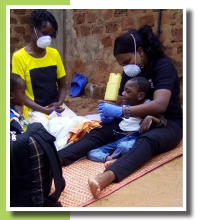
Therapists showing caregivers and siblings simple physio therapy skills for the children.

Cerebral Palsy Africa partnered with Angel's Centre for Children with Special needs (ACCSN) to provide home based care for 71 children with special needs in response to the effects brought about by the COVID-19 novel virus. The project aimed at increasing access to integrated therapy services such as physiotherapy, occupational therapy, speech and language, equipping 70 parents in offering home based therapy