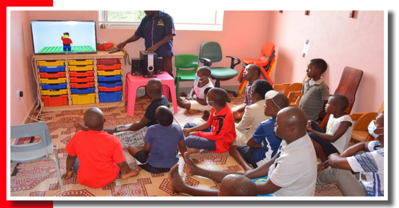
Children learning using television and radio at the centre.

Angels' centre supported over 55 children in early learning and integrated therapy to equip them with basic literacy skills, interpersonal skills as well as Speech and language.