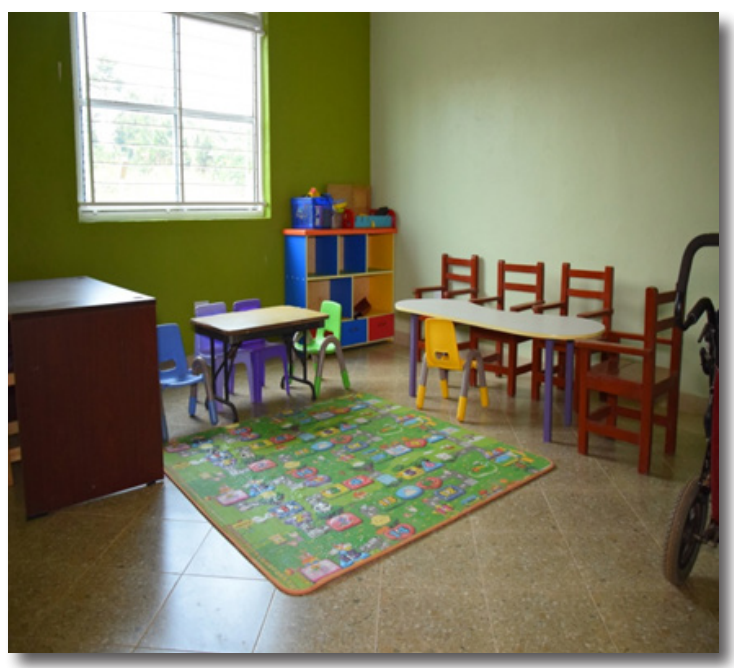
In the pictures above is one of the classrooms and one of the therapy rooms.

We are happy to inform you that we were finally able to achieve our long time dream of having our own fully furnished facility, "CENTER OF EXCELENCE" that can accommodate at least 200 children with special needs. In July 2020 we moved from our former rented premises in Nansana municipality to a place we call home in Bulabakulu-Banda parish Wakiso district. The new facility has a number of rooms, among them are 3 therapy rooms,4 class rooms, a sick bay, a social workers' office, a Director's office, a board room, a bigger reception with a kids corner, a dinning/ common room, inside