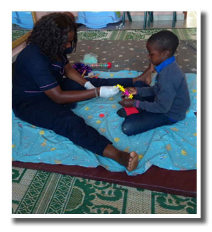
Therapist working with a child during the OPD sessions at Angels' Centre

We put in place an outpatient program to further increase access to physio and psychotherapy among children and parents. This was conducted on a weekly basis where each child and parent received specialized attention for at least two hours. Over 40 children were able to benefit from this program. With the help of the OPD, physical changes were observed among the children including reduced effects like contractures, malnutrition as well as behavioral change such as improved speech and performance of tasks. Moreover, parents were supported through counselling to cope with the overwhelming financial difficulties and emotional distress aggravated during the lockdown period.