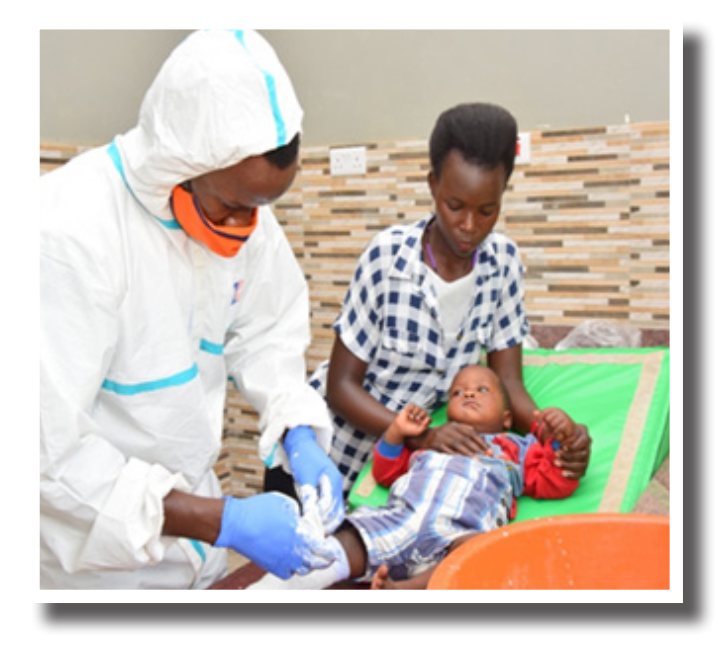
Therapist supporting a parent and child during the OPD at Angels' Centre