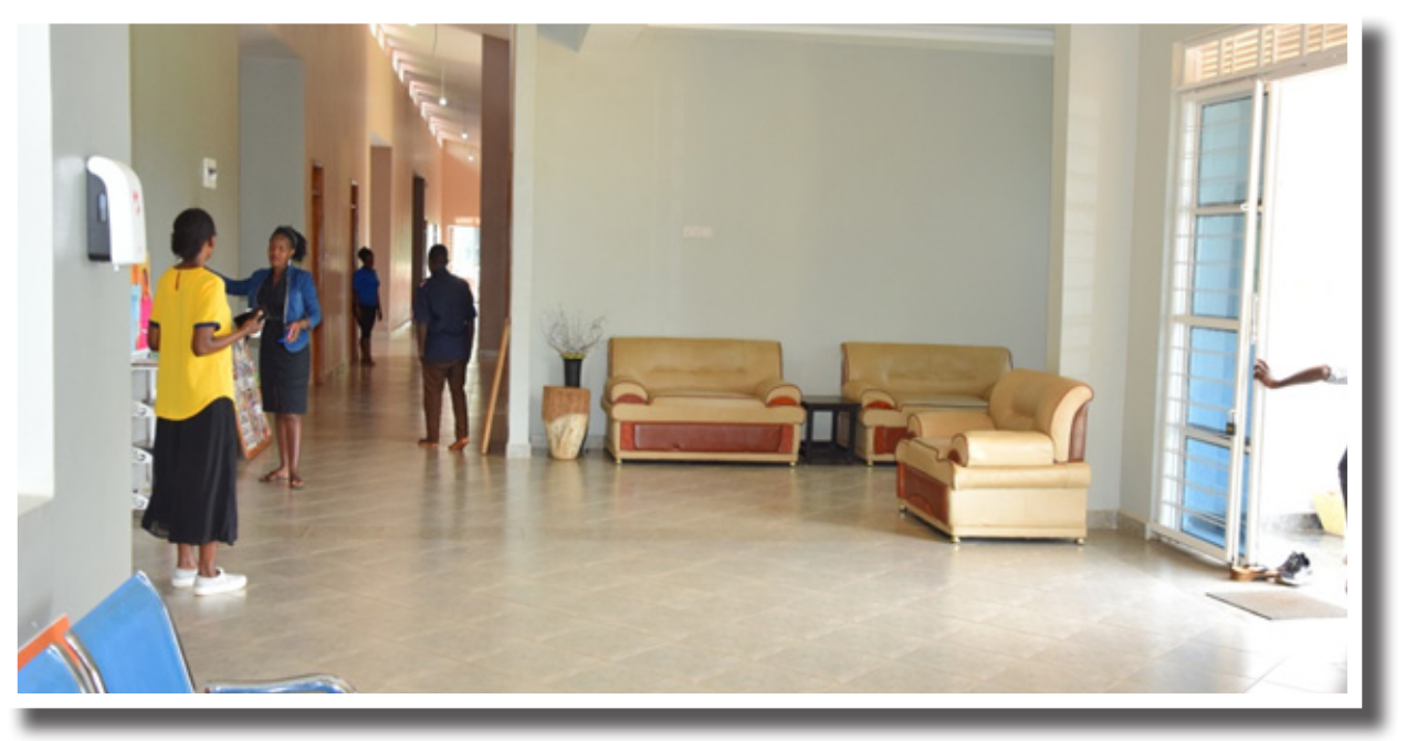
Part of the reception area and the corridor