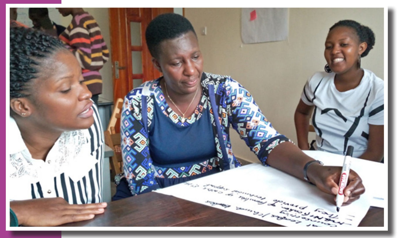
Participants doing group work during the training

To further strengthen our community based programming, 17 participants from Angel's Centre were supported by Cerebral Palsy to develop a Community Based Rehabilitation Strategy. The training was aimed at building the capacity of Angel's Center to develop, implement and monitor a Community Based Rehabilitation Strategy that was relevant to the needs and opportunities available in the community. The participants got more in understanding disability in Uganda, CBR matrix, importance of the International Classification of functional for disability and health to implement disability programs in a harmonized way and situation analysis and mapping of community resources. As a result, Angels' centre drew a CBR strategy.