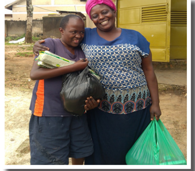
Parents and their children receiving food packages

ACCSN provided nutritious and balanced diet foods to over 150 families raising children with special needs to respond the constraints brought by COVID-19. The family relief packages contained food items like rice, maize flour, and sugar, washing soap, beans, salt, millet flour, groundnuts, cooking oil and powdered milk.