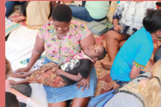
Children and their parents during the speech therapy sessions".