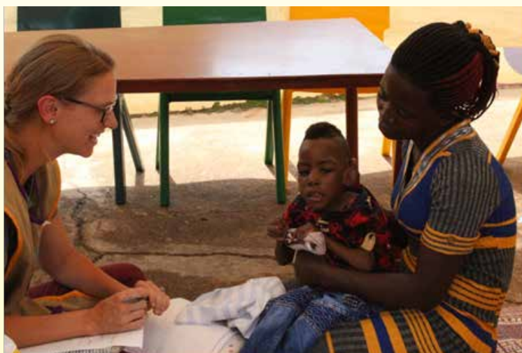
One- on- One assessment session with speech and language therapist