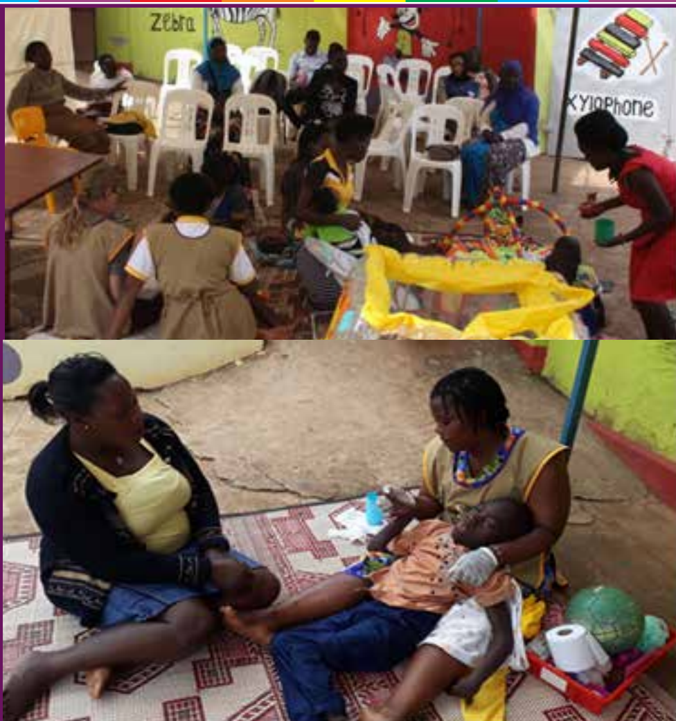
Parents and children during OPD and one to one parent training sessions

Angel's Center started Out-Patient services this year with the purpose of providing an opportunity to families of children with special needs who can't afford to bring their children for therapy services on a daily basis. The main activities carried out include community mobilization of parents, assessment of children, speech and language therapy, occupational therapy to children, counseling and guidance. Parents and guardians are also engaged in various activities like training them on basic therapy exercises to do while at home and others are attaining tailoring skills.