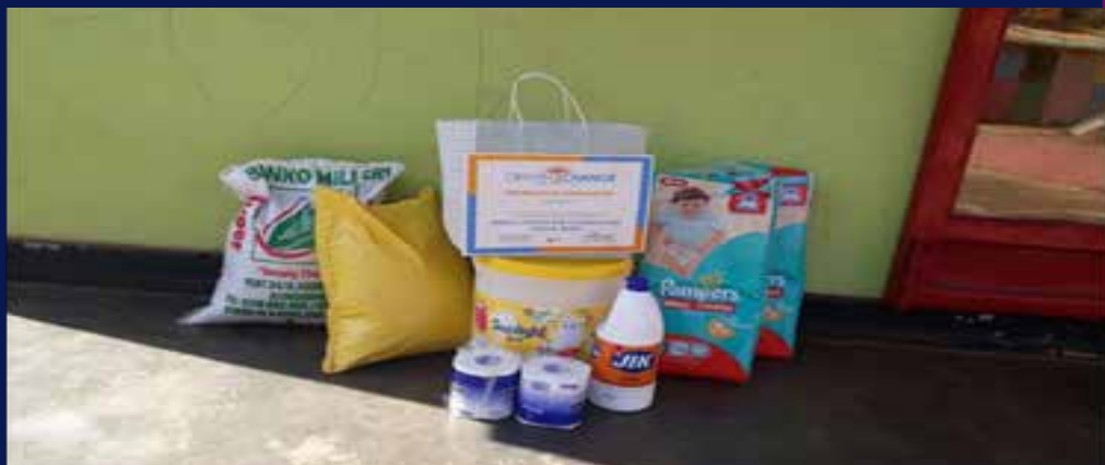
Some items donated to Angel's Center from Driven to Change Foundation