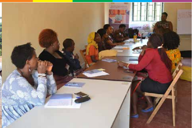
Parents and children during the training