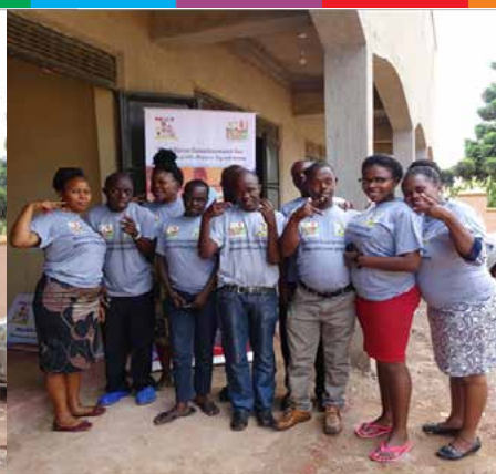
Young adults with Down syndrome after day one training with their trainers