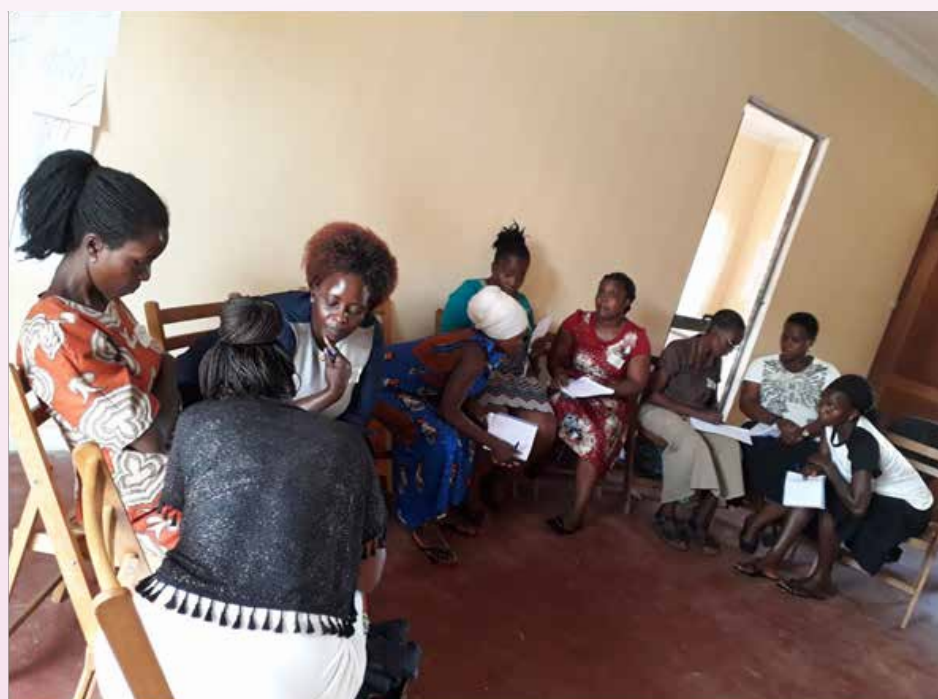
Mothers during small group discussion during the training