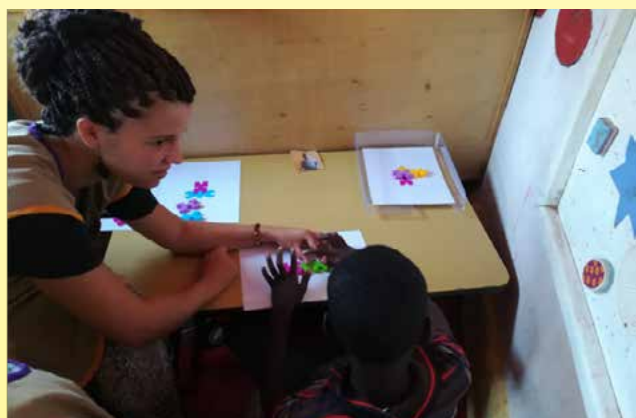
One of the volunteers teaching sorting colors with one child with Autism