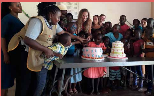
Children cutting two cakes during the Christmas party

Christmas is a time of celebrating and sharing moments of happiness together. Our children celebrated their Christmas in style. 2018 Christmas party was organized and fully sponsored by the internship students from Belgium. It was such a wonderful and colorful day for both children and students saying bye- bye to them. Activities included; Students giving gifts to children, Christmas games, face painting, comedy, dancing and singing, cutting of the cake and awarding certificates to students.