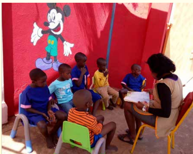
Story telling is funtime

Our early learning activities have been supported widely with staff, therapists and both local and international volunteers. We have been able to implement various activities with children to improve on cognitive, physical and level of independence. With individualized education plans, every child has continued to benefit differently in sensory stimulation, occupational therapy, speech and language therapy, environmental exposure, tacpac and play activities.