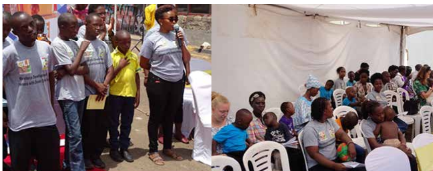
Parents with their children during the event