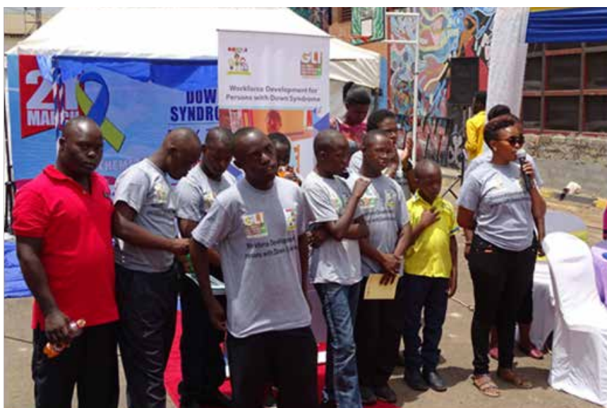
Official launch: "Young adults with Down syndrome that were trained in workforce development."