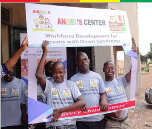
Participants during the workforce development training