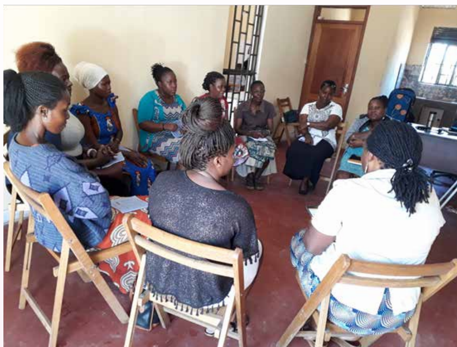
Mothers during a focused group discussion on challenges they face raising children with disability during the gender training

the organizations to implement Women2030 project. Amplifying Mothers voices is the project that we are currently implementing under Women2030 with close monitoring and mentorship from ARUWE. The main goal of this project is to address the needs of young mothers of children with disability with a focus on empowering them through awareness raising and life skills development in a period of six months. This project has benefited over 20 mothers with the following activities; Tailoring skills, Gender, advocacy and awareness and personality skills.