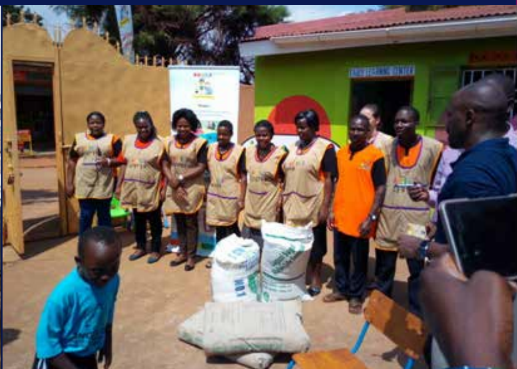
Angel's Center receives 100 bags of cement towards the Building Project