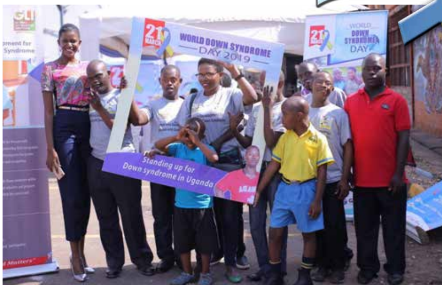
Children with Down syndrome that participated in fashion and runway modeling

with Down syndrome to make the day a successful event. The event took place at Design Hub, Kampala and over 380 people were in attendance. The main objective of the day was to establish a way in which Government of Uganda can step in to promote inclusion for children with Down syndrome in schools across Uganda. The theme of the event was "Standing up for Down syndrome in Uganda". It was such a colorful day whereby many important persons in Government attended. Activities involved included one week of free treatment for all persons with Down syndrome and this was sponsored by Children's clinic Naalya, a fashion show by persons with Down syndrome and a Mountain hike organized by the Mountain Slayers of Uganda. During the event, we officially launched the workforce development program which raised a lot of interest from parents who want their children to train with us.