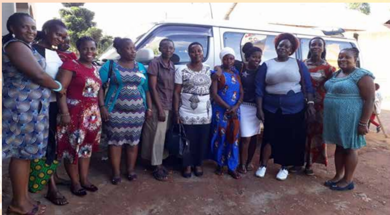
A group photo of some mothers in the Parents Support Group initiative

Early this year, Angel's Center opened up the parents' support group initiative as a unit under Angel's Center for children with special needs. The Angel's Center Parents Support Initiative is an important platform for both parents and children because parental functioning especially in terms of economic independence is very key for most families raising children with disabilities. The parents support Initiative was therefore set up to provide adequate sup-