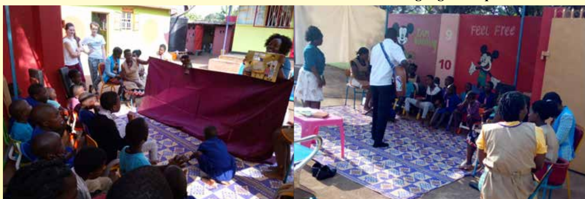
Children and staff during prayer time with members from the Scripture Union