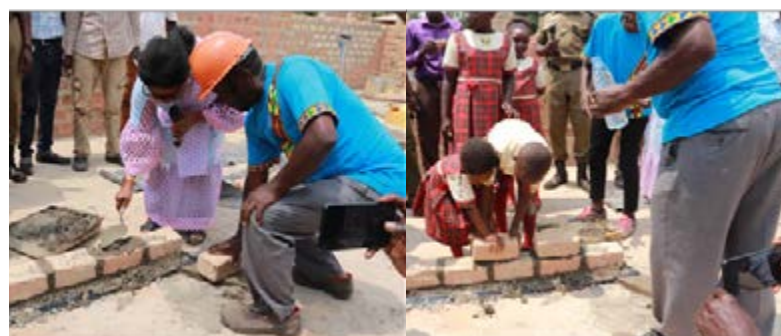
"School children and the guest of honor laying bricks during the summer camp".

The Build with us Summer Camp was conducted on the 26th, July, 2019 at New Angel's Center building site with the purpose of resuming the construction process. The building / construction process had paused since September 2018 due to limited funds. Over 200 people from different corners of Wakiso and Kampala attended and benefited from the summer camp. Over 80 children with disability were reached out with different therapy services: speech and language therapy, physio therapy, deworming, children fun-play learning activities, counseling and guidance to their parents and guardians.