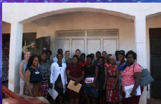
Primary teachers during IEPs training and in a group after their training