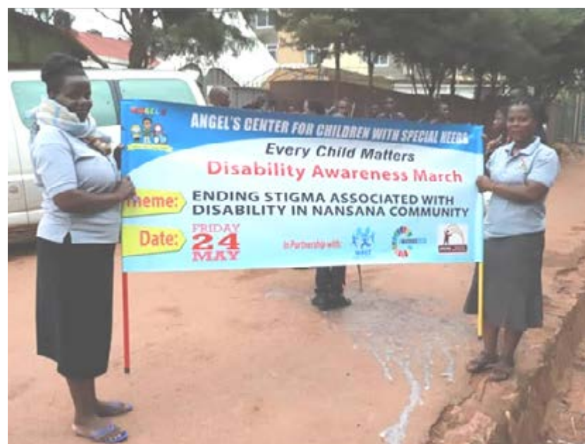
Ending Stigma associated with Disability in Nansana community

In June, Angel's center conducted a community awareness march on the streets of Nansana. The main goal of the march was to combat the levels of stigma and discrimination associated with disability in the community. Over a long time, Angel's Center has provided community integrated services to families of children with special needs and one of the challenges identified was stigma, increased discrimination and negative attitudes from the society. It was a reflection of real life situation of parents while interacting with and sharing their stories. The theme was "Ending stigma associated with Disability in Nansana community". A total of 63 people attended and actively participated in the march. The key take away was paving way for parents to bring out children with disability into the public to receive social services like education, therapy and shelter.