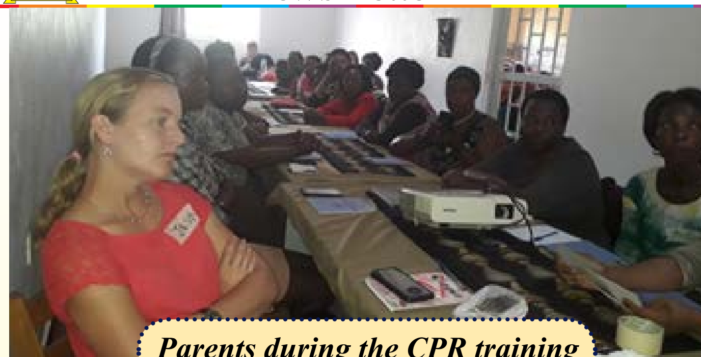
Parents during the CPR training