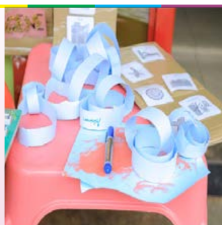
Children during therapy sessions & some learning materials