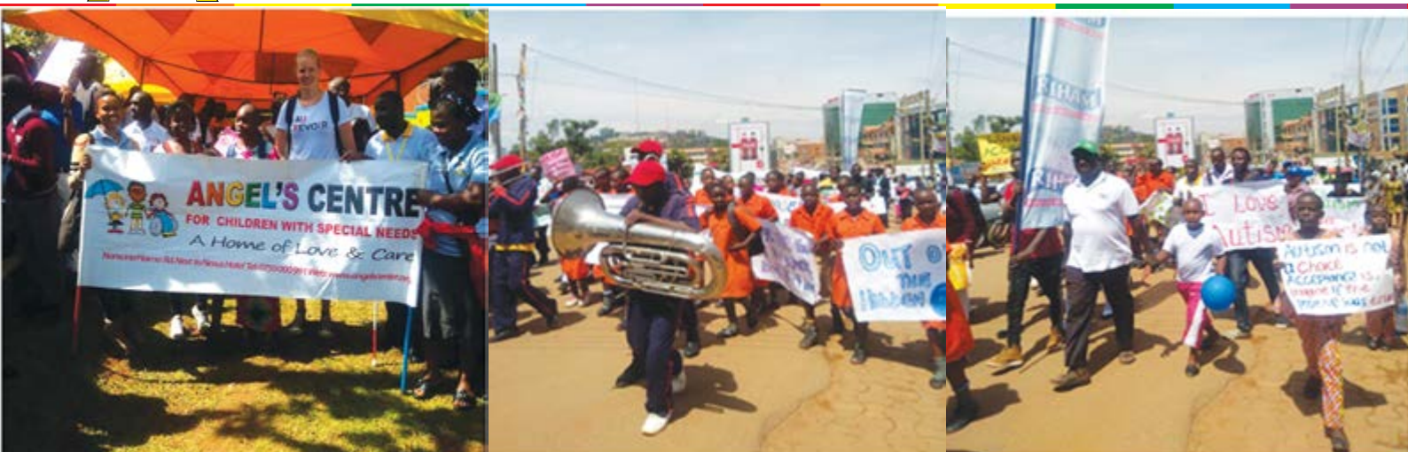
"Angel's Center children, parents and staff during the awareness march on the streets of Kampala".