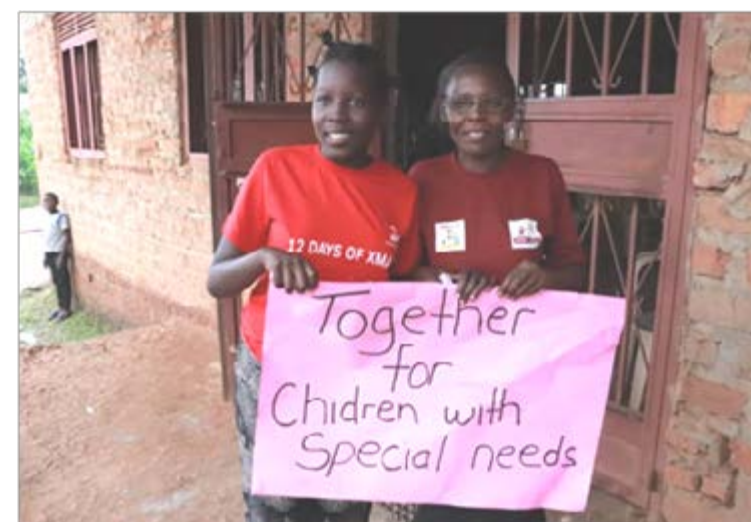
Parents, children, volunteers and staff participating in the awareness march