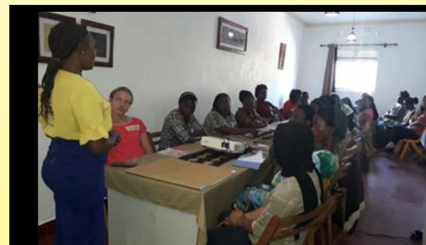
One of the parents from Nairobi sharing her life story of how she was neglected by the husband after giving birth to child with cerebral pulse