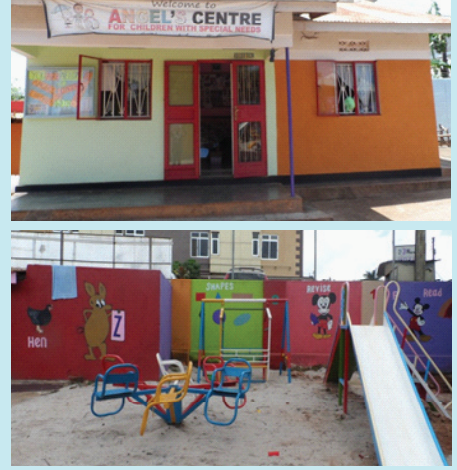
The above photos show the current look for office and play equipment (Swings) for children after renovation.

Early learning and play equipment has also been purchased. The renovation of the office premises was supported by Wereld Missie Hulp -Belgium.