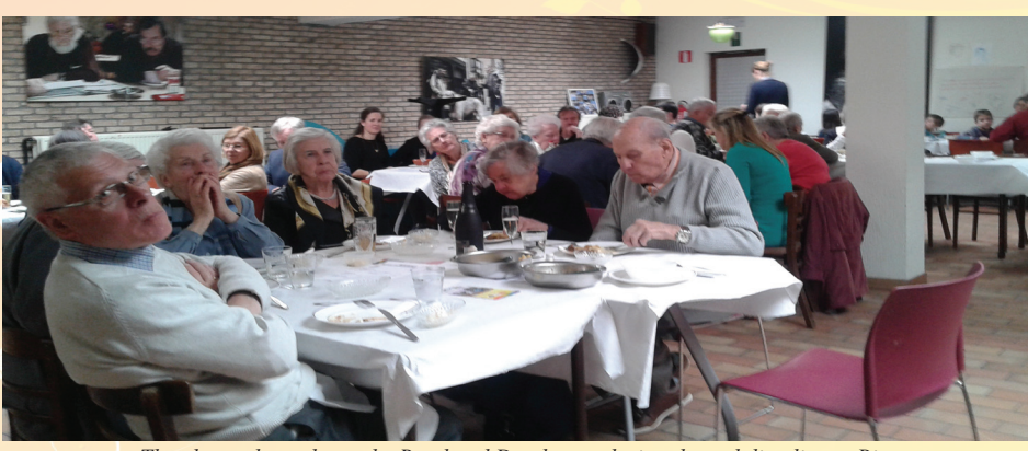
The above photo shows the Raad and Daad team during the sodality dinner. Big thanks to the Raad and Daad for supporting and organizing the solidarity Lunch

in the same month, Angel's Center Support Group-Belgium in partnership with Raad and Daad VZW organized a solidarity Lunch in support of Angel's center for Children with Special needs in Uganda. Over 85 people attended and 1,800 euros was raised in support of the project in Uganda. We would like to appreciate Raad and Daad VZW for giving back to children with special needs in Uganda. This fund is going to be used to purchase assistive devices like special chairs, improve the learning environment, and conduct community Rehabilitation programs.