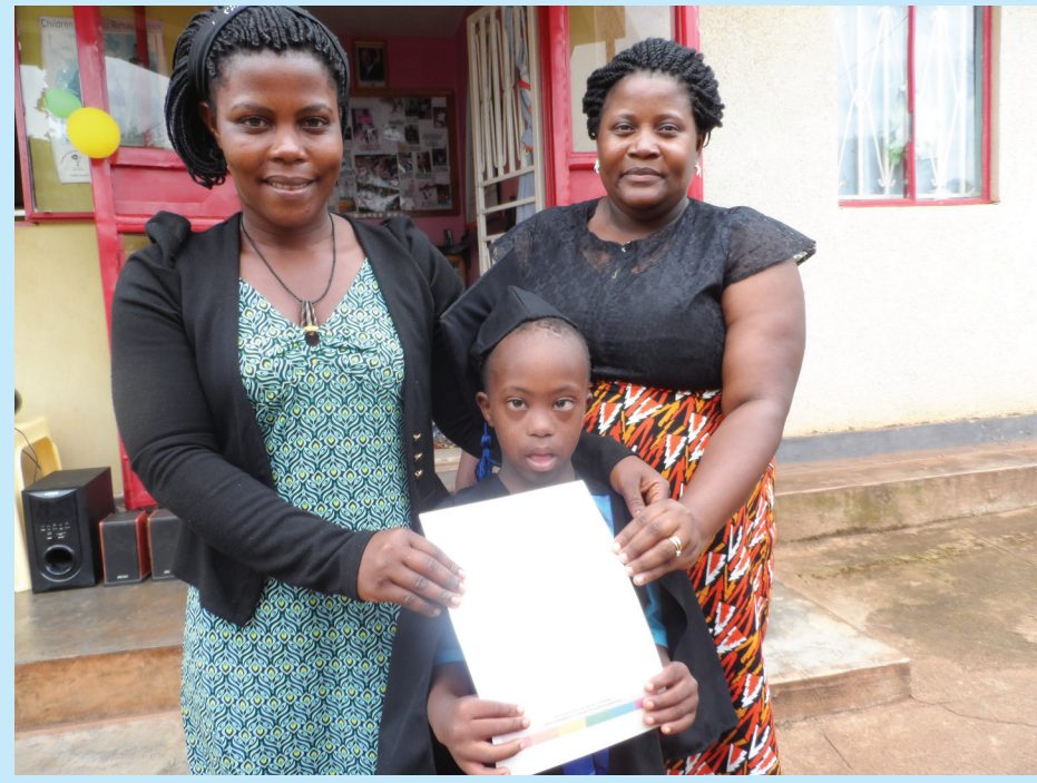
The above photos show children and their parents at the graduation ceremony after receiving their certificates of accomplishing the early learning.