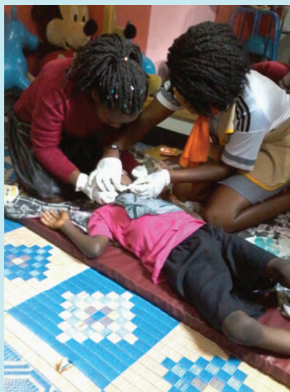
The above photos show the speech therapist training parents on how to handle children during frustrating situations and managing challenging behavior at home

On the other side, physiotherapy and speech therapy have also been going on at the center. Speech therapy has involved parents into the intervention process. This has helped parents make efforts to understand their child's diagnosis and become active participants in the process. Information sharing from parents with the therapists understands how a child responds and how to manage their challenging behaviors at home hence this has provided consistency in working with the child in therapy sessions and at home