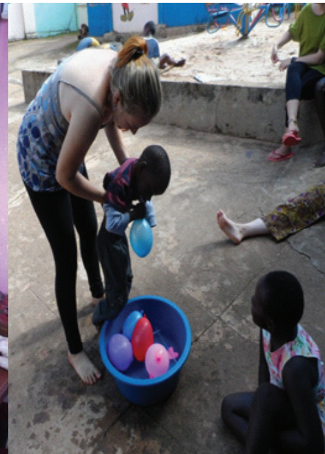
The above photos show children learning different themes with help volunteers and teachers