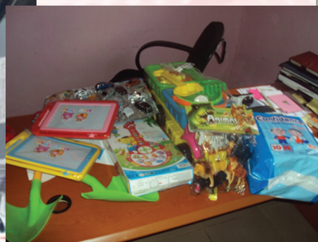
Toys donated to the center by Anneke one of the volunteers