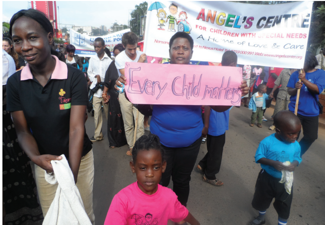
Awareness march during the sports gala in June 2014