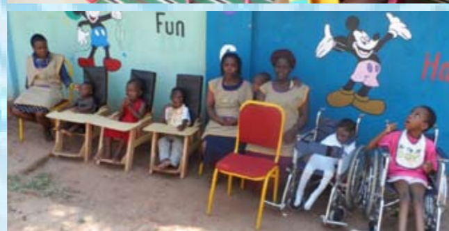
This picture shows children sitting on CP chairs, wheelchairs and teachers also sitting on their chairs.