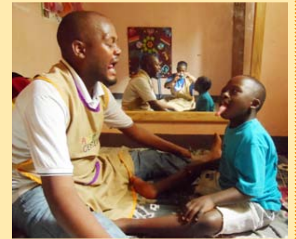
This picture shows the speech and language therapist assessing a child during a home visit.

W e have sustained the different kinds of therapies at the center and all children are receiving occupational therapy with a focus of identifying environmental barriers to individuality and involvement in daily activities. Children have been supported through various interventions including adapting the environment, modification of tasks and teaching skill with a purpose of increasing participation and performance of daily activities. Nevertheless, other children have benefited from Speech and Language therapy. Oral motor skills have been addressed for proper structure, function, speech and sound production to children. Emphasis has been intended to improve coordination, strength, movement and placement of the lip seal, tongue and cheeks. Thank you the city of Antwerp for continuously sustaining this cause!!!!