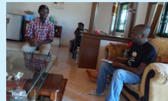
The therapist interviewing a parent during a home visit.

H ome visits were carried out in eight homes. The aim of home visits was to assess the home environment of the children and to provide improved opportunity for educating and training family members on how to handle their children. Home visit questionnaires and observation were used as guiding tools in assessing home environment. Therapist elaborated and explained the kind and level of intervention given to individual child. More so, parents were given chance to raise any concerns about their children.