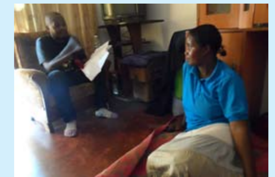
The therapist explaining an outcome evaluation report of a child to a parent.