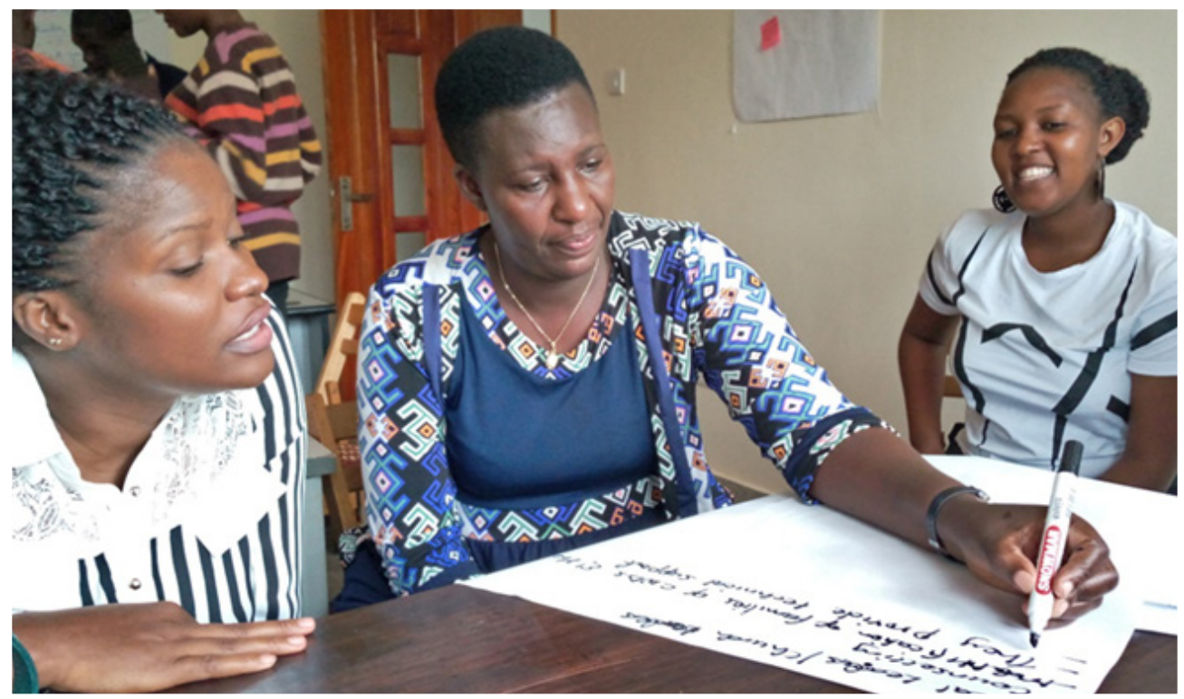
Participants doing group work during the training

To further strengthen our community based programming, 17 participants from Angel's Centre were supported by Cerebral Palsy to develop a Community Based Rehabilitation Strategy. The training was aimed at building the capacity of Angel's Center to develop, implement and monitor a Community Based Rehabilitation Strategy that was relevant to the needs and opportunities available in the community. The participants got more in understanding disability in Uganda, CBR matrix, importance of the International Classification of functional for disability and health to implement disability programs in a harmonized way and situation analysis and mapping of community resources. As a result, Angels' centre drew a CBR strategy.