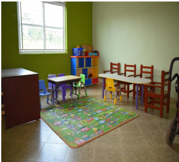
In the pictures above is one of the classrooms and one of the therapy rooms.

We are happy to inform you that we were finally able to achieve our long time dream of having our own fully furnished facility, "CENTER OF EXCELENCE" that can accommodate at least 200 children with special needs. In July 2020 we moved from our former rented premises in Nansana municipality to a place we call home in Bulabakulu-Banda parish Wakiso district. The new facility has a number of rooms, among them are 3 therapy rooms, 4 class rooms, a sick bay, a social workers' office, a Director's office, a board room, a bigger reception with a kids corner, a dinning/ common room, inside