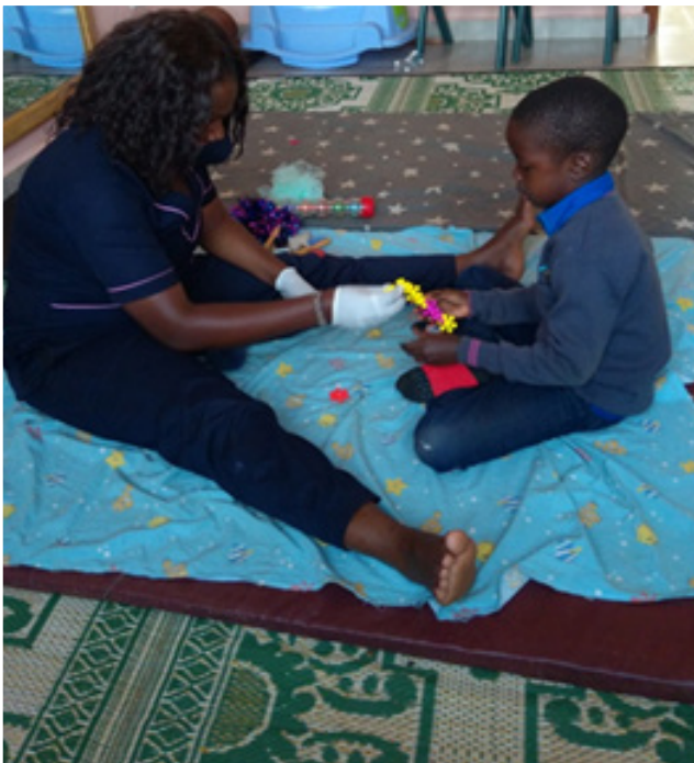
Therapist working with a child during the OPD sessions at Angels' Centre

We put in place an outpatient program to further increase access to physio and psychotherapy among children and parents. This was conducted on a weekly basis where each child and parent received specialized attention for at least two hours. Over 40 children were able to benefit from this program. With the help of the OPD, physical changes were observed among the children including reduced effects like contractures, malnutrition as well as behavioral change such as improved speech and performance of tasks. Moreover, parents were supported through counselling to cope with the overwhelming financial difficulties and emotional distress aggravated during the lockdown period.