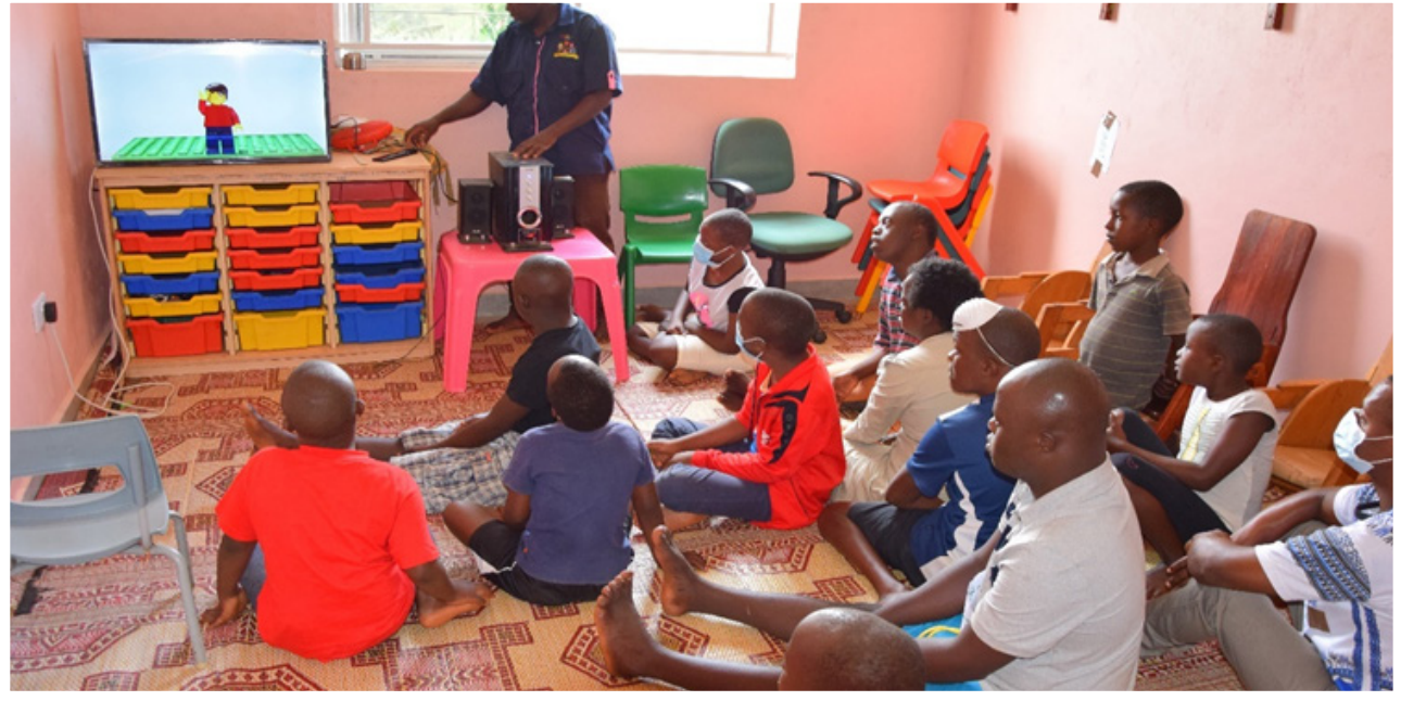
Children learning using television and radio at the centre.

Angels' centre supported over 55 children in early learning and integrated therapy to equip them with basic literacy skills, interpersonal skills as well as Speech and language.