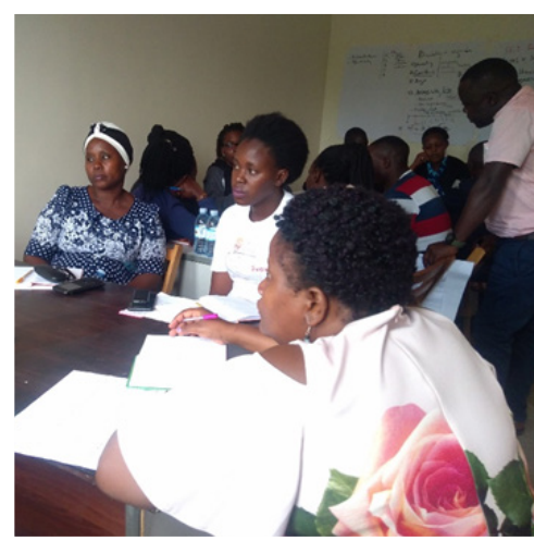
Participants during group discussions