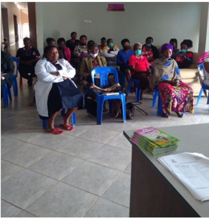
Participants during the parents' meeting at ACCSN