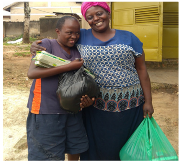
Parents and their children receiving food packages

ACCSN provided nutritious and balanced diet foods to over 150 families raising children with special needs to respond the constraints brought by COVID-19. The family relief packages contained food items like rice, maize flour, and sugar, washing soap, beans, salt, millet flour, groundnuts, cooking oil and powdered milk.