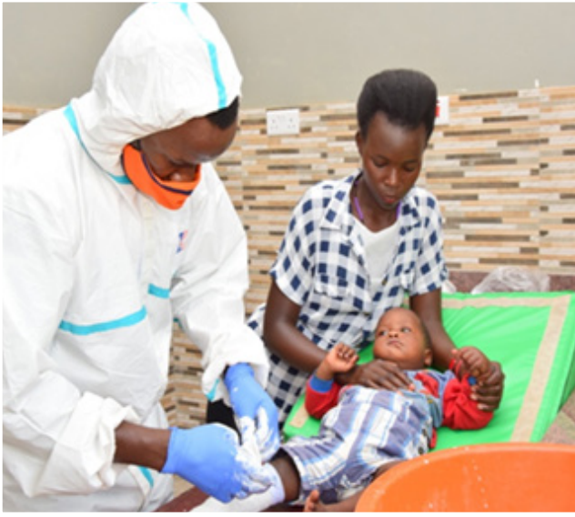
Therapist supporting a parent and child during the OPD at Angels' Centre