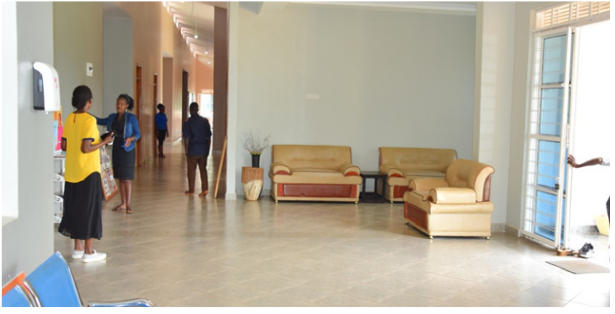
Part of the reception area and the corridor