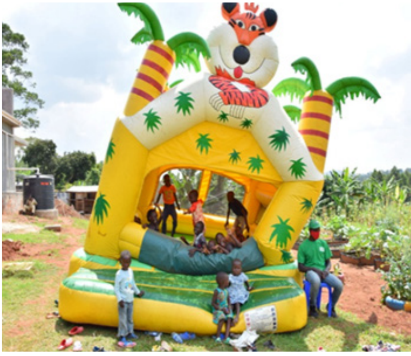
Children playing during the party

Despite the challenges and uncertainties of 2020, just like our culture has always been, the year was crowned with a Christmas party for the children in partnership with the Rupareria Foundation. It was a day filled with a lot of fun, play, eats and drinks. Over 100 families and children with special needs attended and every child went back home with a gift hamper from the Rupareria Foundation.