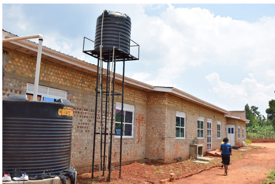
Tank installed to provide water at the centre

The plumbing has enabled timely access to water for the kitchen, toilets and bathrooms leading to improved hygiene among the children and the entire facility. In addition, children and caretakers have clean water for drinking.