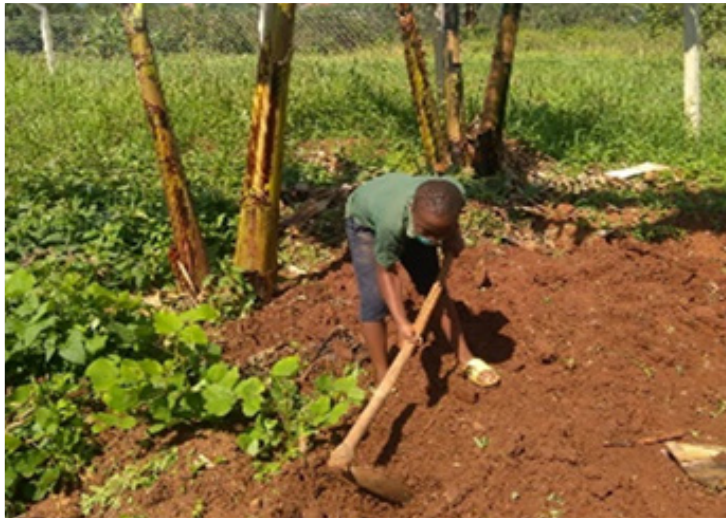
Shadati learning how to garden. Such skills also enhanced their physical and mental health.