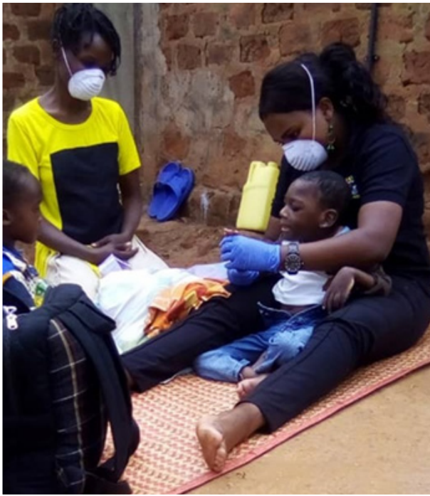
Therapists showing caregivers and siblings simple physio therapy skills for the children.

The social skills training came in handy for siblings and other family members. The trainings enabled caregivers to understand better ways of handling their children while performing self-care routines, in ways that are safer and more comfortable for both the child and caregiver. The trainings were conducted during the home visits and were suited to the child and family need.