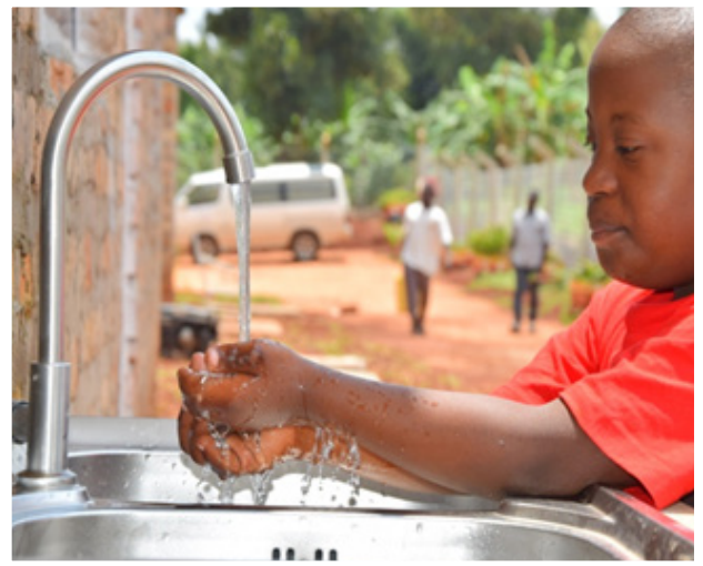
Participants learning how to wash their hands perfectly. This skill is key to enhancing hygiene especially for COVID-19 prevention and other hygiene related diseases.

Furthermore, we held engagement meetings with three employers for persons with Down syndrome on the importance of workforce development and providing internship, volunteer and employment spaces for them. Two of the employers provided employment spaces for two young adults to assist in office management and being messengers.