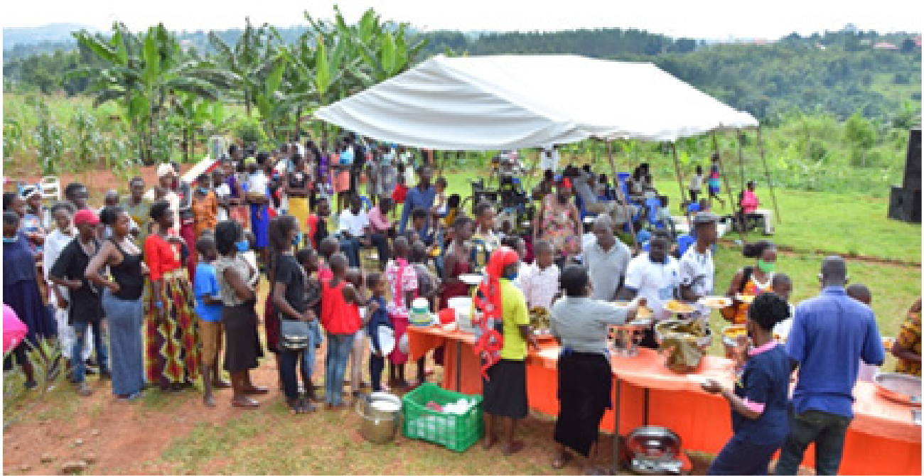
Parents and children enjoying a meal

What a way to wrap up the year! The purpose of the Christmas party was to celebrate with our families especially those that cannot afford a Christmas celebration in their homes to also have that amazing feel and for the children to remember and celebrate the birth of Jesus Christ irrespective of the situation and conditions they are going through.