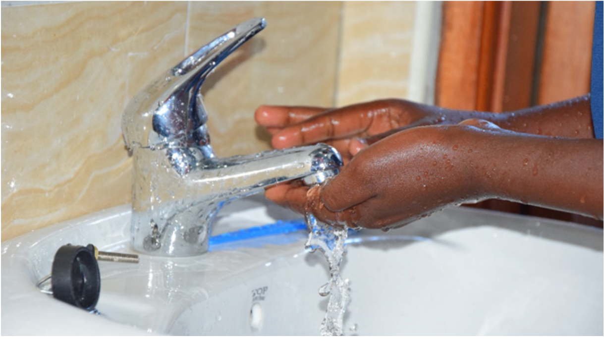
Tamale- beneficiary at ACCSN washing his hands at one of the sinks.

The routine learning sessions were however interrupted by COVID-19 restrictions and parents were not able to bring their children to the center for early learning and integrated therapy services for close to 4 months.