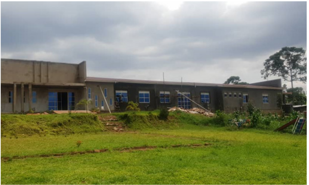
The outside view of the new Angel's center.