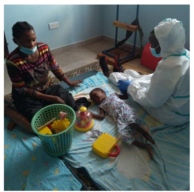
Therapy session to support mobility and transfer training.