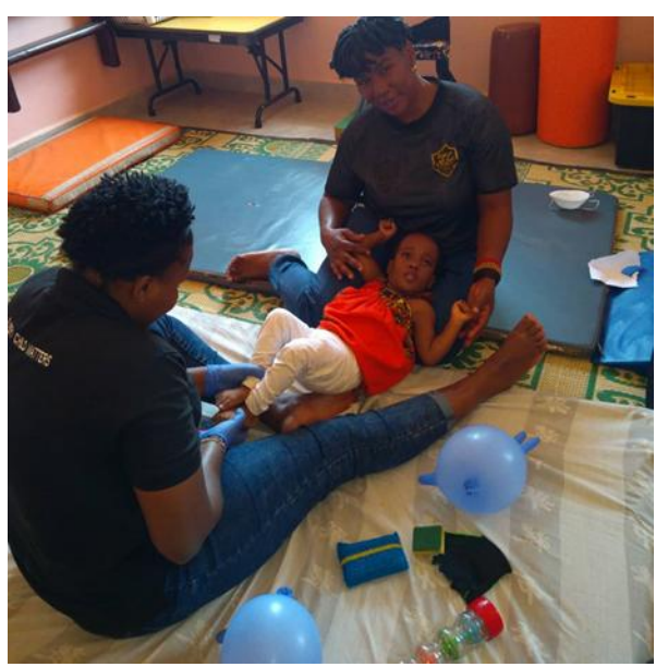
Therapists conducting sessions with the children.